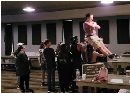
Trust fall game

This past month Thrive finished off their summer of group building events.