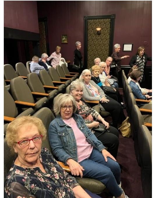
Here's the group attending Smoke on the Mountain.