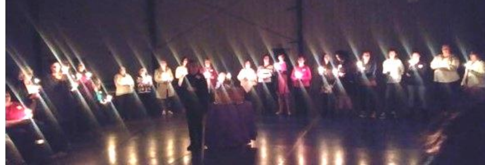
If you are interested in the Women's Ministries, or even if you're just curious, call: